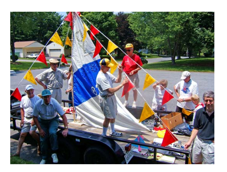
To Creation (thanks float building crowd)