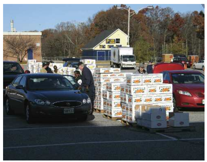
100% of all proceeds go to help the local community.