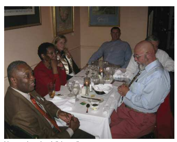
Lions enjoyed a delicious dinner.