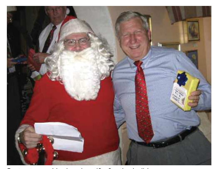
Santa stopped by bearing gifts for the holiday.