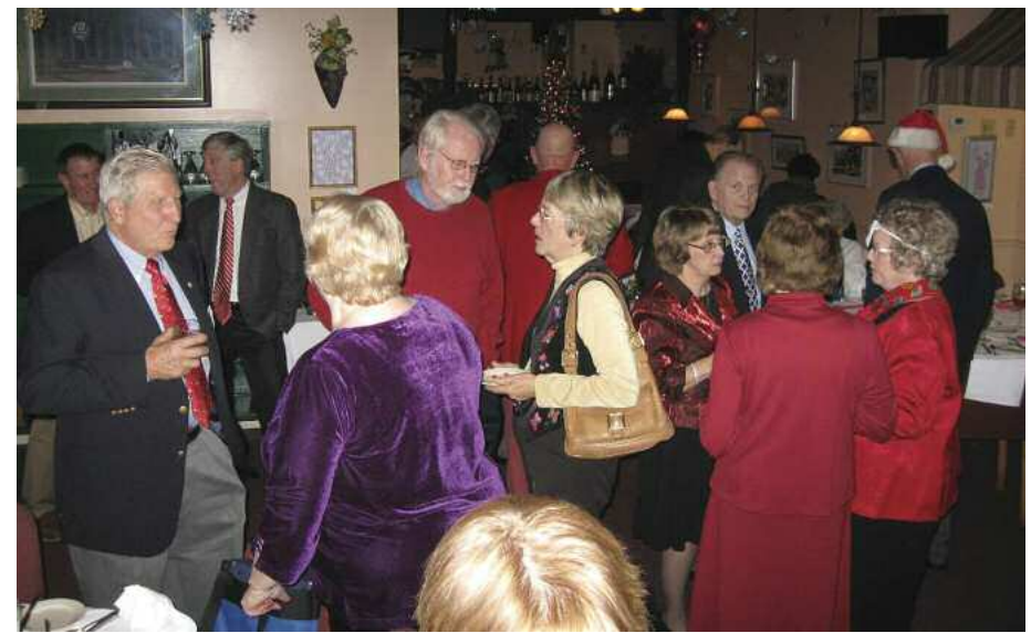
SRLC Christmas party at Café Bretton in Severna Park, MD.