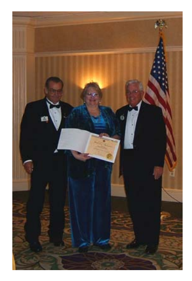
(I didn't plan for the halo, but nice touch isn't it?)