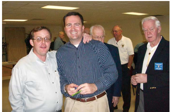
Prospective members were warmly received.