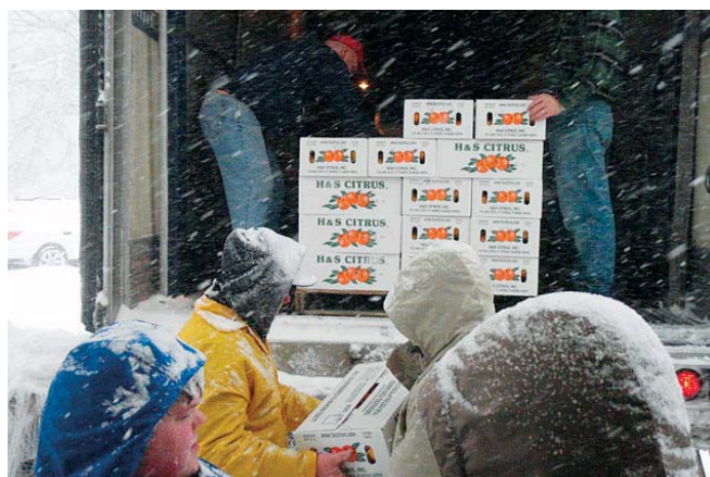
Fruit fresh from sunny Florida is unloaded in Maryland's near blizzard conditions...