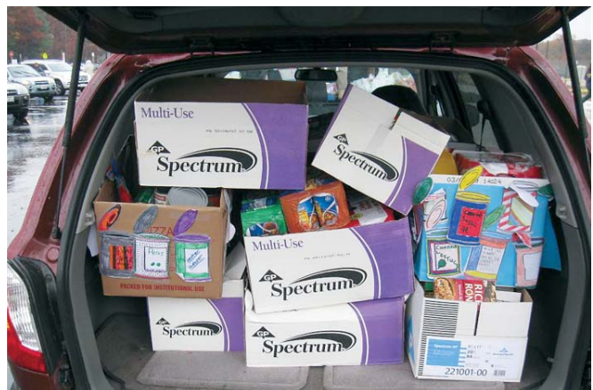
Some of the brightly decorated donation boxes.