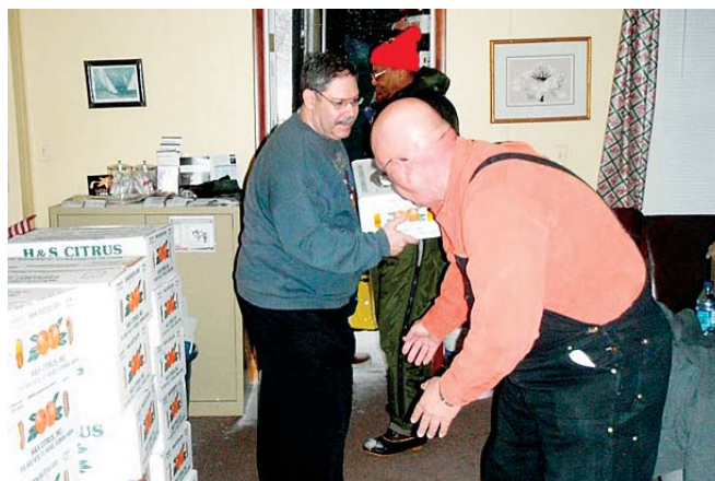
...and stacked, individually, case-by-case, for distribution from the Severna Park Health Center.