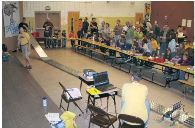
Pack 688's new aluminum race track with electronic finish line and computer scoring system.

The Pinewood Derby is not only a great competitive event but an excellent opportunity for father and son bonding. Lions can look forward to helping Pack 688 with this event again next year.