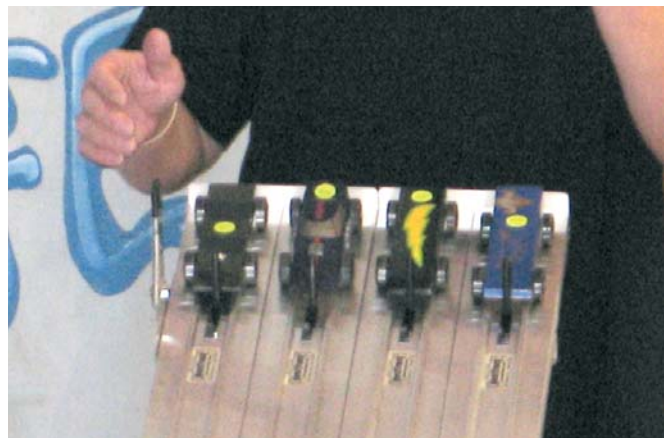
Pinewood Derby cars lined up at the starting gate.