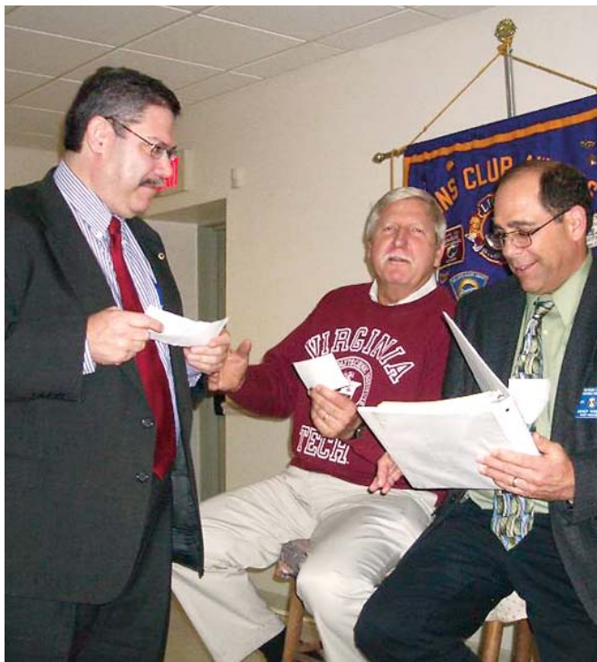
Fruit sale "Booth Training" took place at the November general meeting – it was also "College Sweatshirt Night."

Lions can be proud of this eyeglass recycling effort and members should consider attending the next sorting in April 2010.