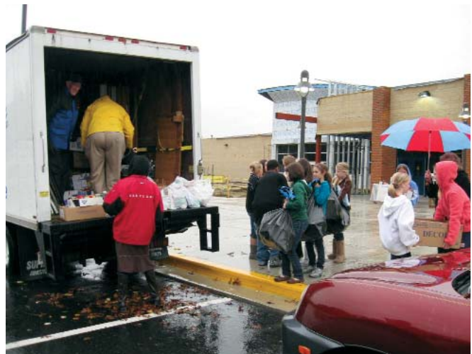
Rain did not dampen the LEO’s spirit.

SPAN is the real winner in this competition and we can take pride in this activity that will benefit many deserving families.