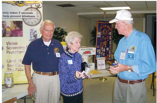
Displays and hands-on exhibits were set up to educate prospective members on SRLC activities and fundraisers.

Prospective members were given a brochure about SRLC and will be contacted to confirm possible membership. Special thanks to all the Lions who contributed time and talents to crafting the visuals which were a highlight at Bring a Friend Night.