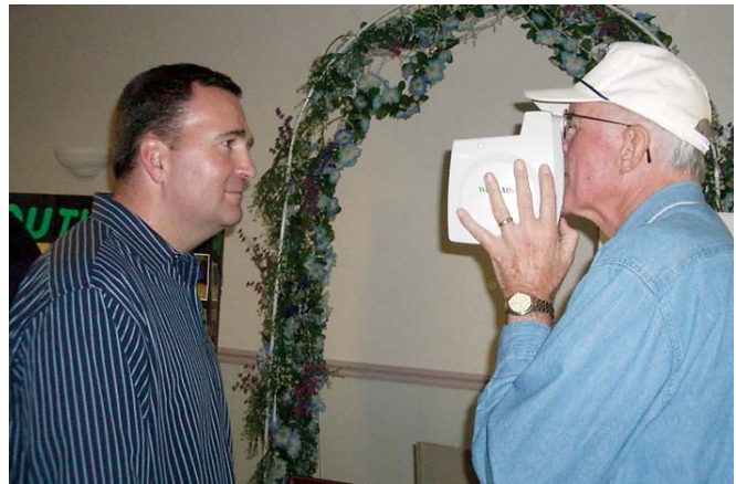
Lion Ollie demonstrates eye screening equipment.

Don't Forget...Ledo's Pizza Night is the 4th Wednesday of each month!