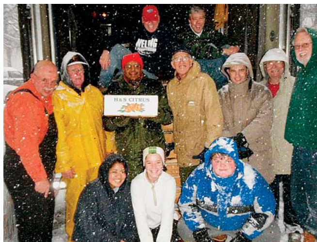
The SRLC December arctic fruit sale crew. "Adapt and overcome" was the phrase of the day.

Let's hope for better weather at the January 23 sale which also will be at a different location due to a conflict at SPHS, this time to the Severna Park Baptist Church on Benfield Road . See you at the next sale!