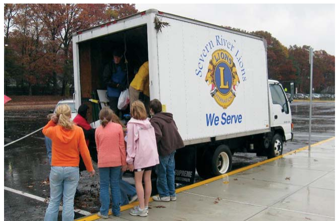
The SRLC truck is loaded to capacity with SPAN donations.