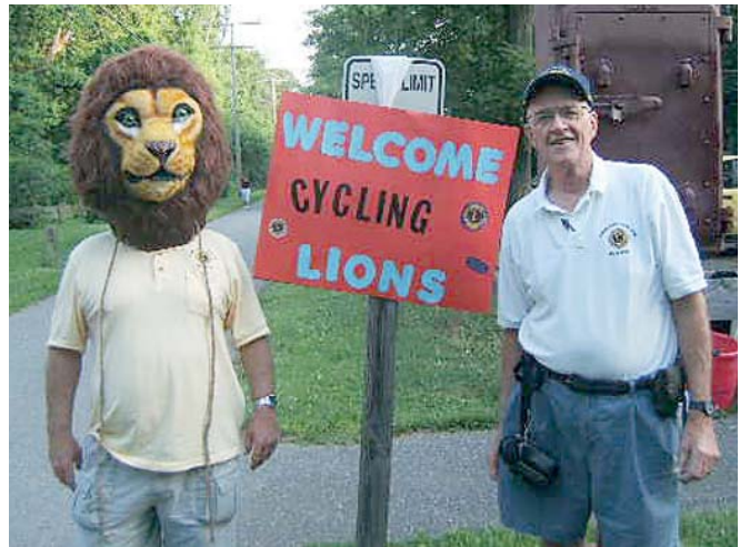
SRLC Lions were on hand to greet the cyclists and offer cold water and snacks.

or by visiting the website, LionsCyclingforSight.org .