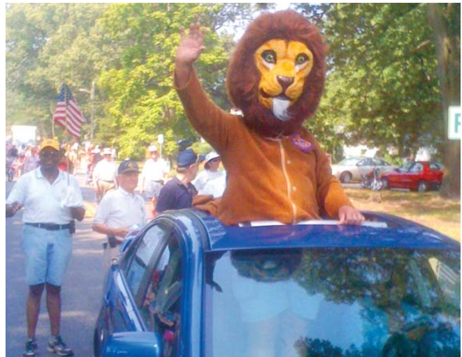
King Lion Trent, in the newly refurbished lion costume, waves to parade spectators.

After turning the final corner the Lions marched upgrade to Cypress Creek Park. There the Lions continued the tradition of handing out Popsicles to the weary marchers. To say that the icy treats were appreciated on this torrid day would be an understatement. For nearly two hours the Lions were available to give Popsicles to marchers of the nearly sixty units in this year's parade.