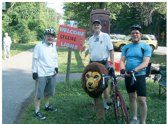
During the half hour stop there were opportunities to talk and learn about the new club.