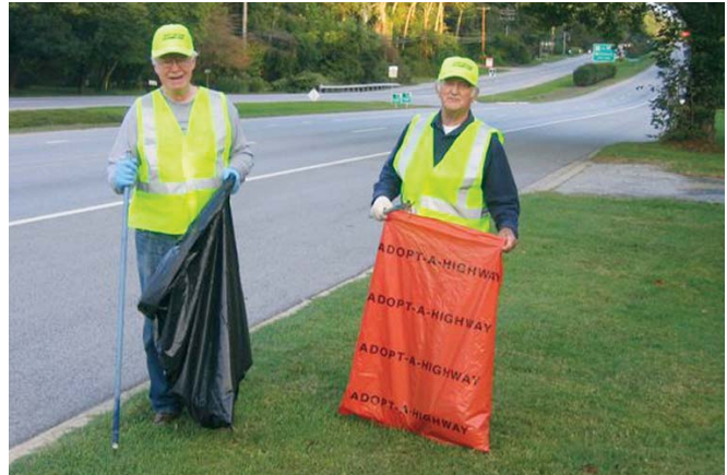
SWAT volunteers at work keeping our community clean.