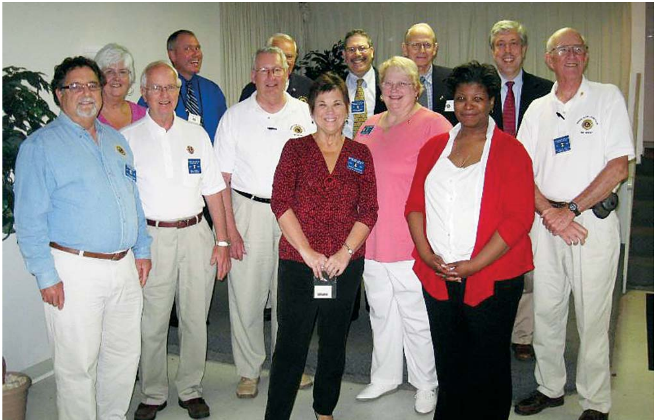
Severn River Lions Club Board of Directors 2010 to 2011.