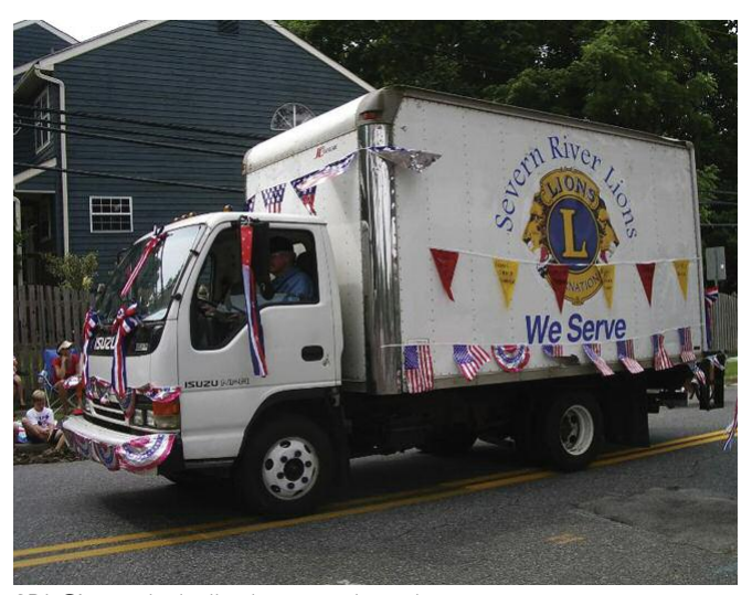
SRLC's patriotically decorated truck.