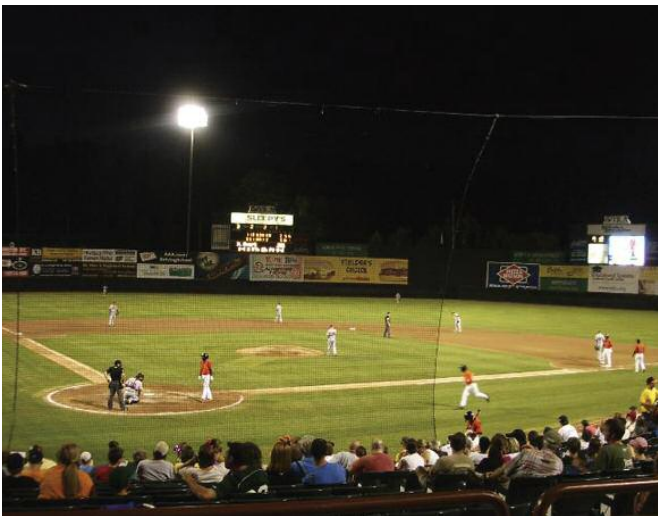
Bowie Baysox take on the Richmond Flying Squirrels.

Lions Night at the Baysox was a fun event for all in attendance so watch out for next year.