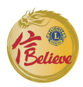
International Theme for 2011–2012 "I Believe"