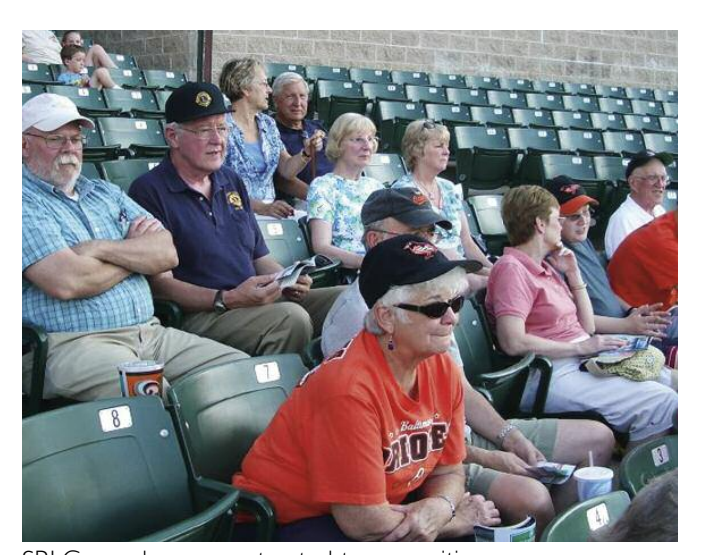
SRLC members were treated to an exciting game.