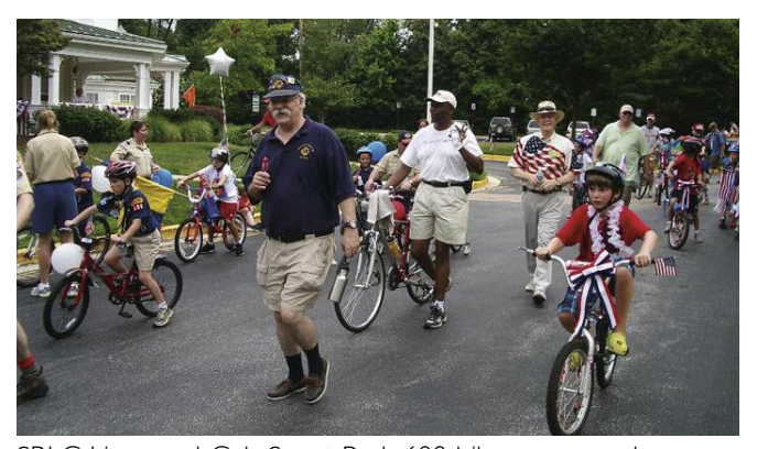
SRLC Lions and Cub Scout Pack 688 bikers on parade.