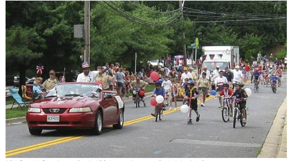
SRLC and Cub Scout Pack 688 in the Severna Park July 4th Parade.