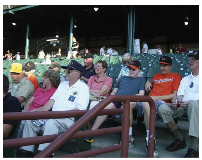
The game was great fun for all attendees.