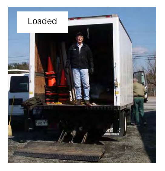
And note the nice lift gate to help us out in our dotage.