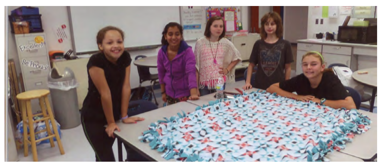
Quilt made by SPMS LEO's for a nursing home resident