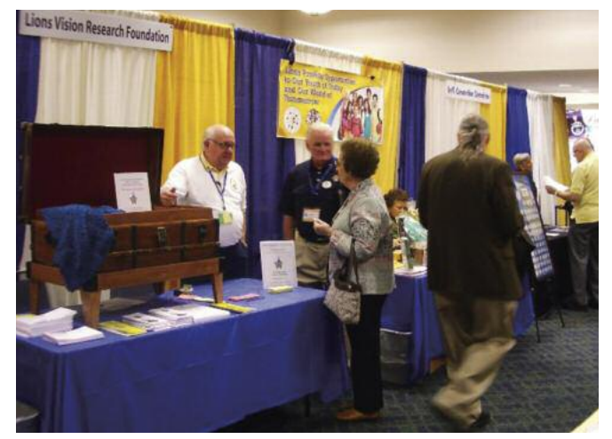
Lions Vision Research Foundation display in the vendor room.