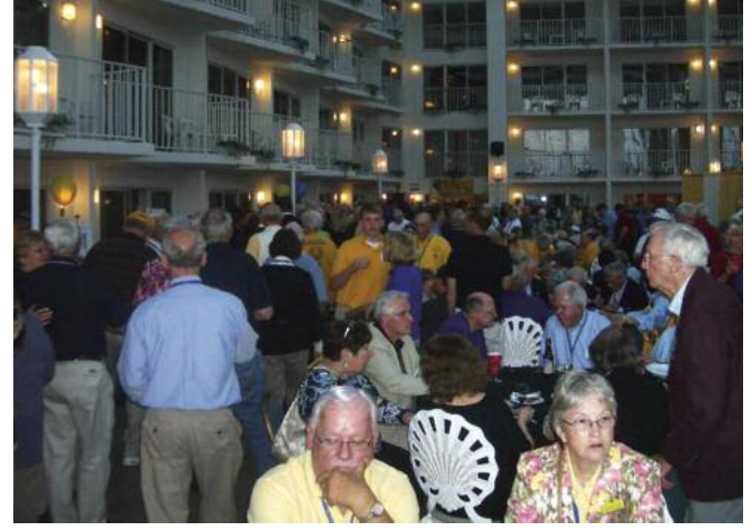
VDG Dinner was well attended, and gave Lions a chance to socialize with members throughout the multiple district area.