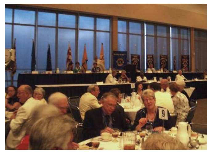
Attendees enjoying Lions fellowship at the formal dinner.