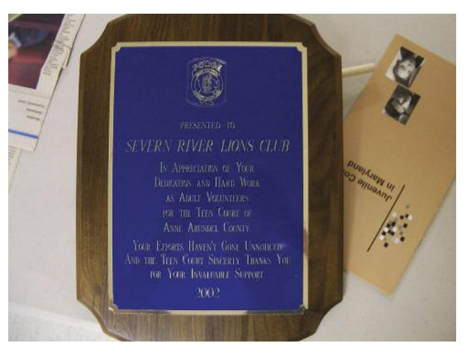
SRLC Teen Court plaque.