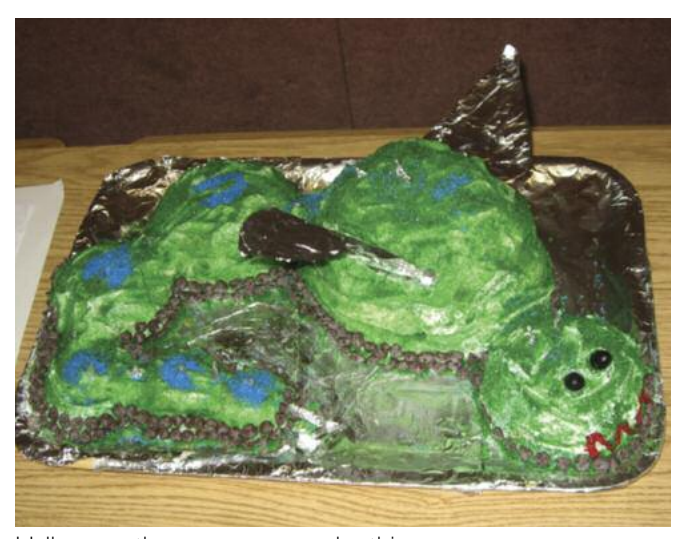
Halloween themes were popular this year.