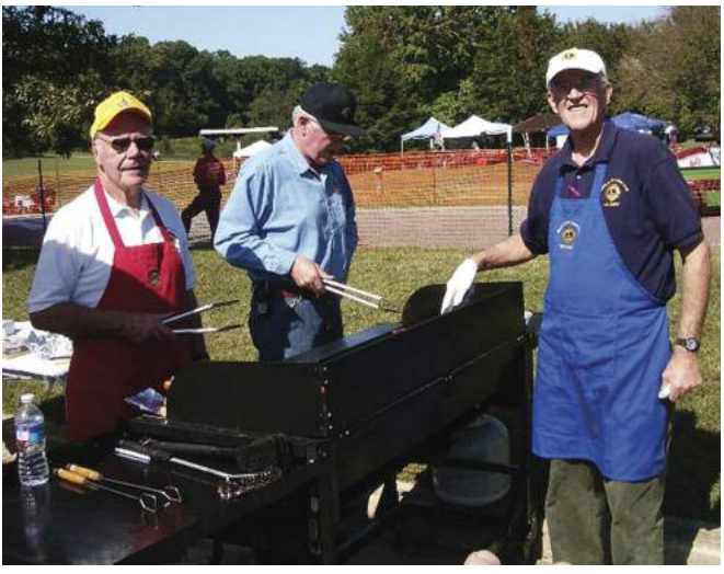
SRLC grillmeisters prepare for the days work.