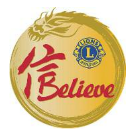
International Theme for 2011–2012 "I Believe"