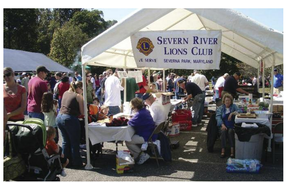
SRLC in action at the Kinder Farm Park Fall Festival.