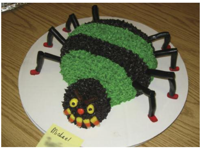
A scary spider cake.