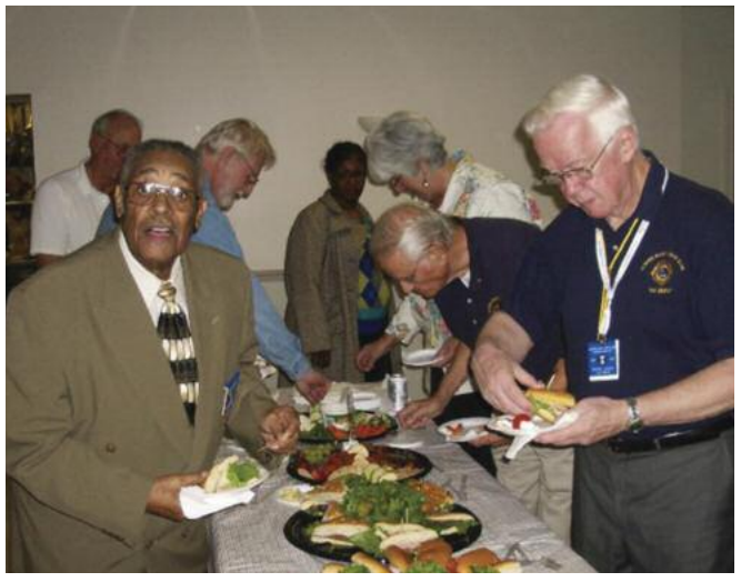
Guests enjoyed sandwiches and snacks.

Special thanks to the Lions who set up the displays and brought prospective members to the Bring a Friend event.