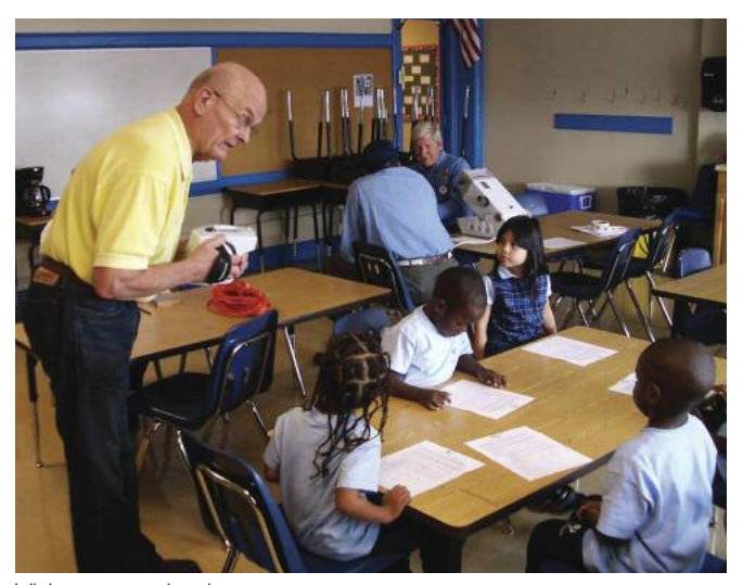
Vision screening in process.