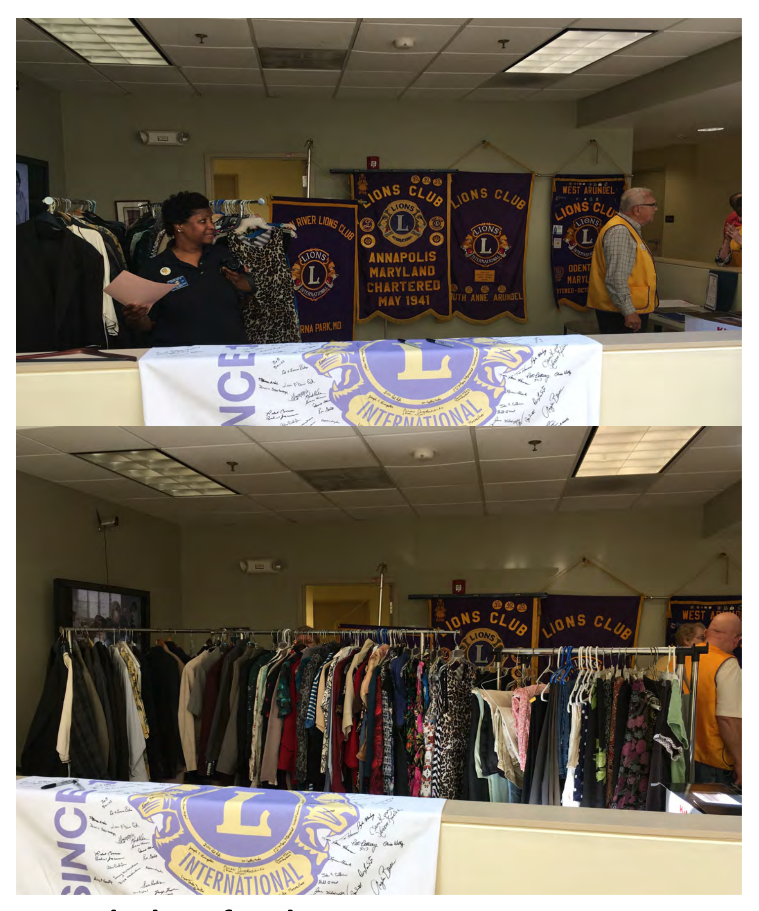
Clothes for the LIGHTHOUSE SHELTER