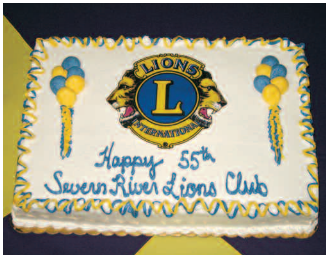
The SRLC 55th Charter Night celebratory cake.