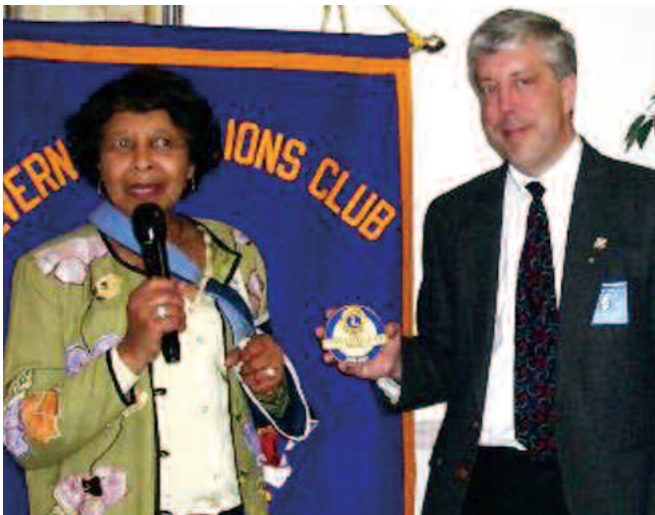
IPDG Senora presents the 100% Presidents banner patch.