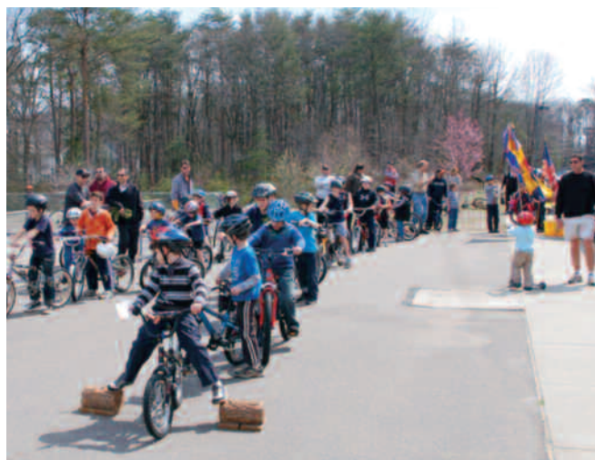
Pack 688 and 855 scouts lined up and ready to start!