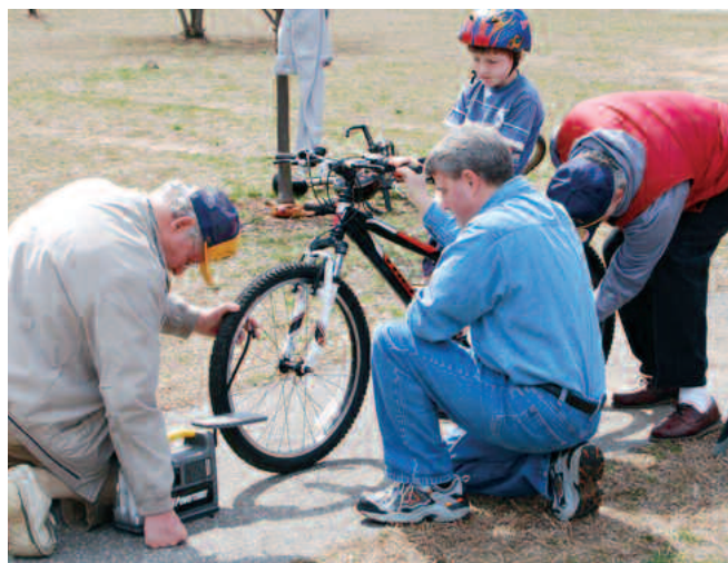
The pit crew inspecting a bike.