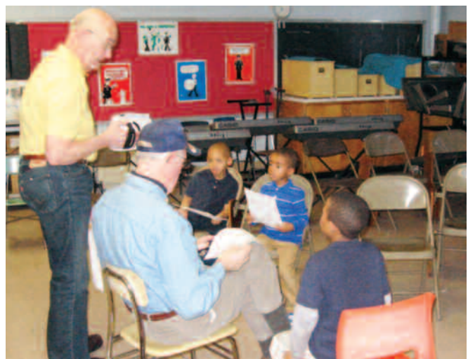
Test results are presented and discussed with the children.