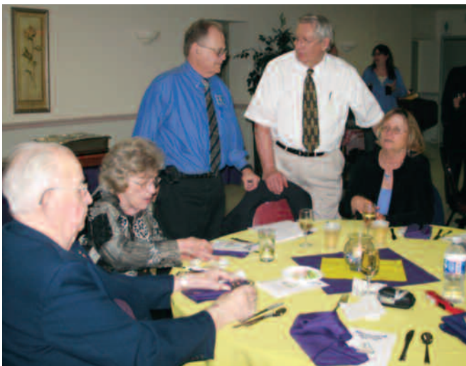
Lions enjoy time to socialize at the brightly decorated tables.