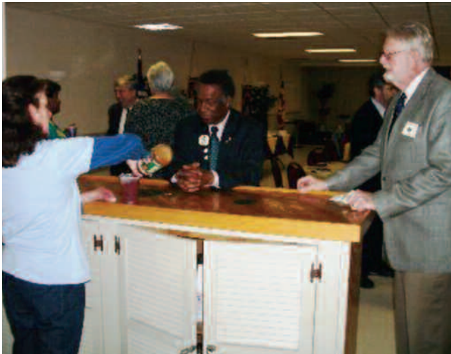
Libations were available at the bar.