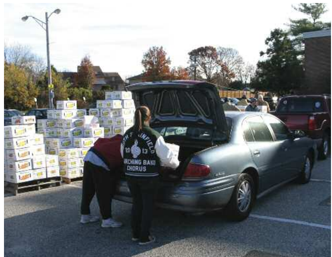
Lions and SPSHS band volunteers hard at work loading fruit.

The season’s first citrus sale rivaled previous sales and King Orange Bill Z deserves credit for organizing this event. SRLC will be back in January for more delicious H&S fresh citrus sales. See you then!