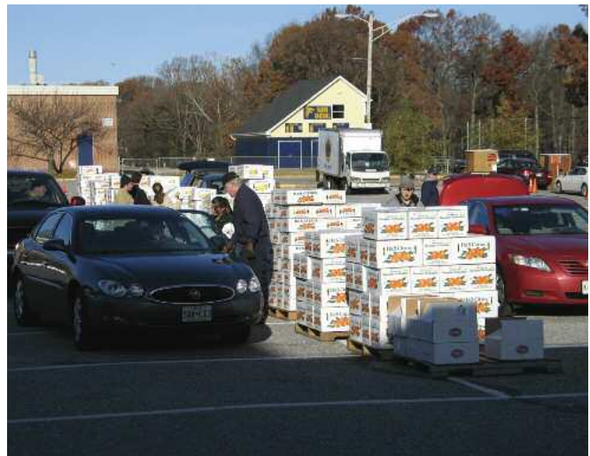
100% of all proceeds go to help the local community.