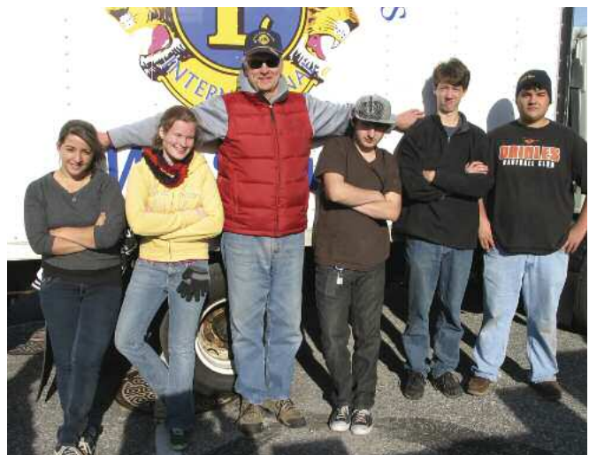
Severna Park High School band volunteers.