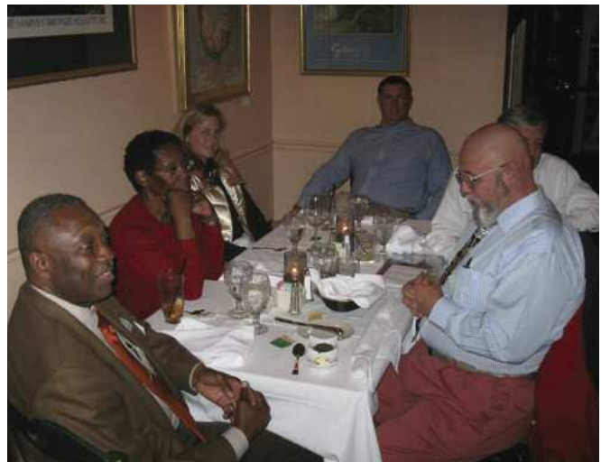
Lions enjoyed a delicious dinner.