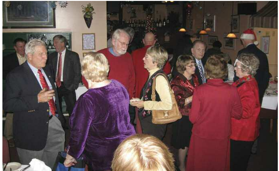
SRLC Christmas party at Café Bretton in Severna Park, MD.