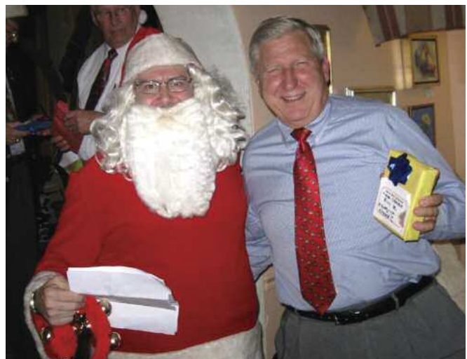
Santa stopped by bearing gifts for the holiday.