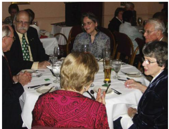
SRLC Lions gathered for the holiday feast.