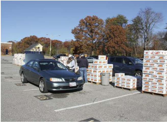
The November fruit sale was pleasant and mild. Money raised will benefit the local community.