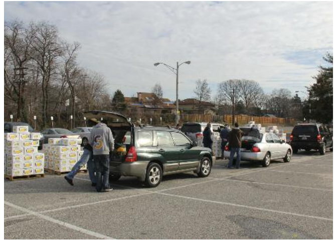
The December fruit sale, less leaves on the trees, but no snow on the ground!