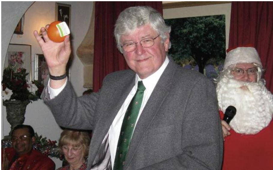
SRLC Holiday Party at Café Bretton in Severna Park.