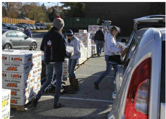
Severna Park High School student volunteers from the marching band busy loading boxes of fruit.