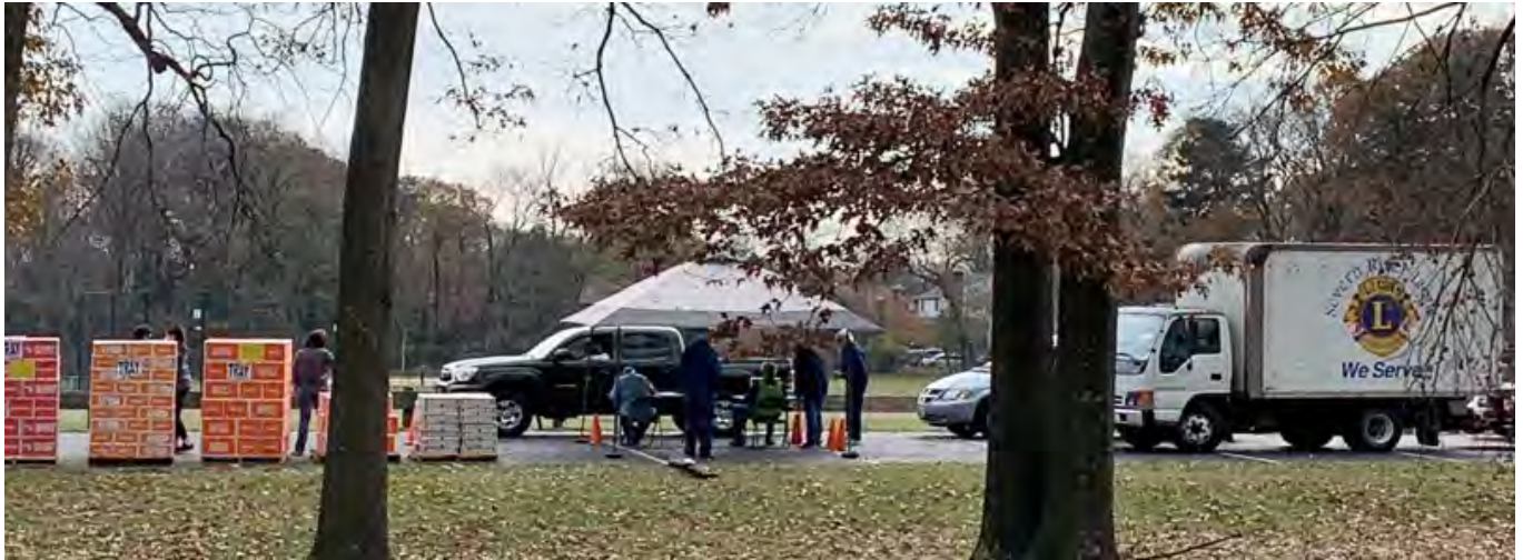
SRLC Fruit Sale Nov 2020 at Cypress Creek Park