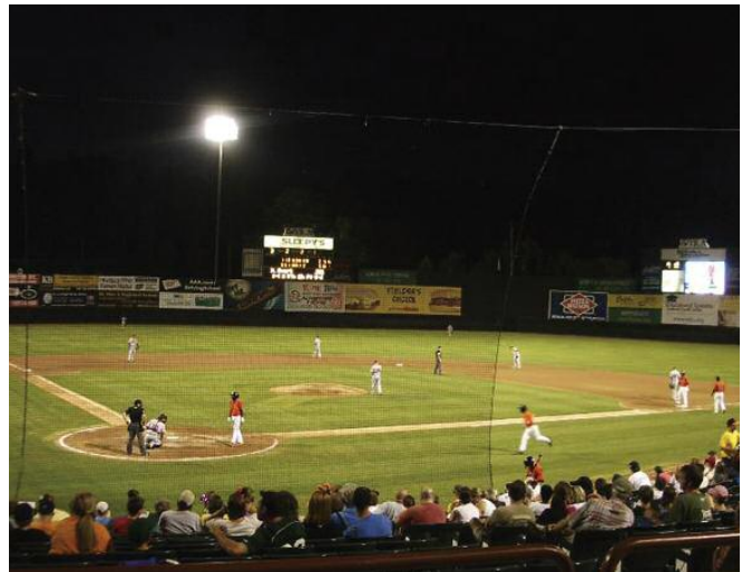
Bowie Baysox take on the Richmond Flying Squirrels.

Lions Night at the Baysox was a fun event for all in attendance so watch out for next year.