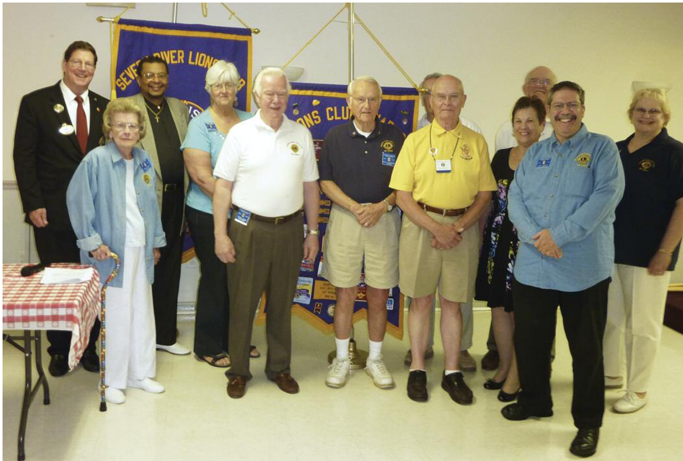
Severn River Lions Club 2011-2012 officers.