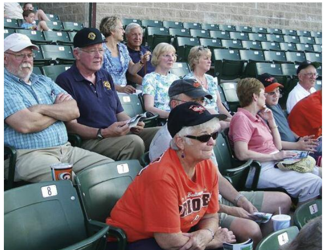
SRLC members were treated to an exciting game.