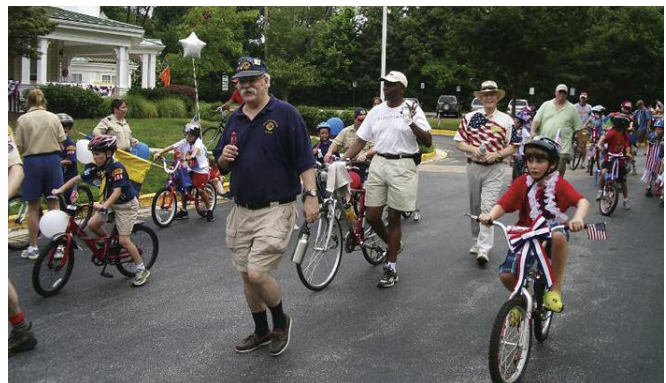
SRLC Lions and Cub Scout Pack 688 bikers on parade.