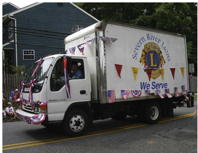
SRLC’s patriotically decorated truck.