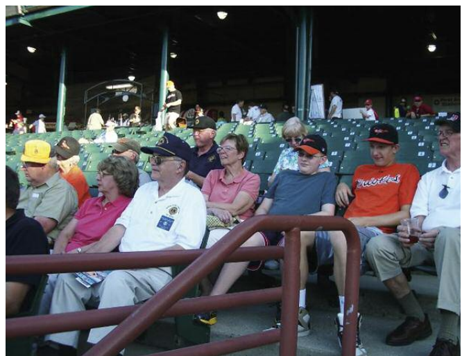
The game was great fun for all attendees.