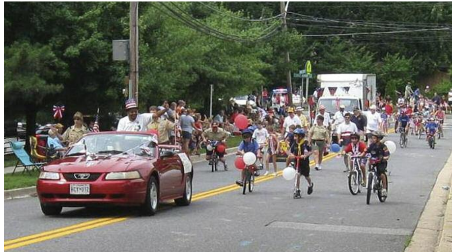
SRLC and Cub Scout Pack 688 in the Severna Park July 4th Parade.