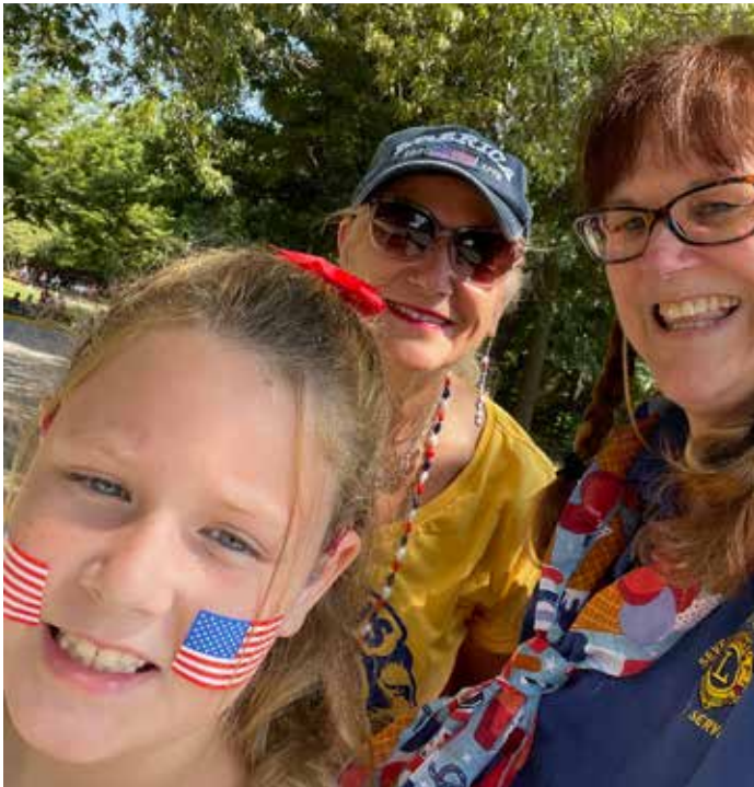
Severn River "Popsicle Detail" prepares for distribution with smiles.