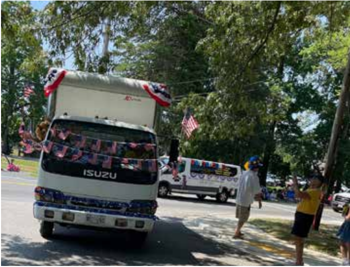
Fully decorated Severn River Lions Club Truck prepared for duty.