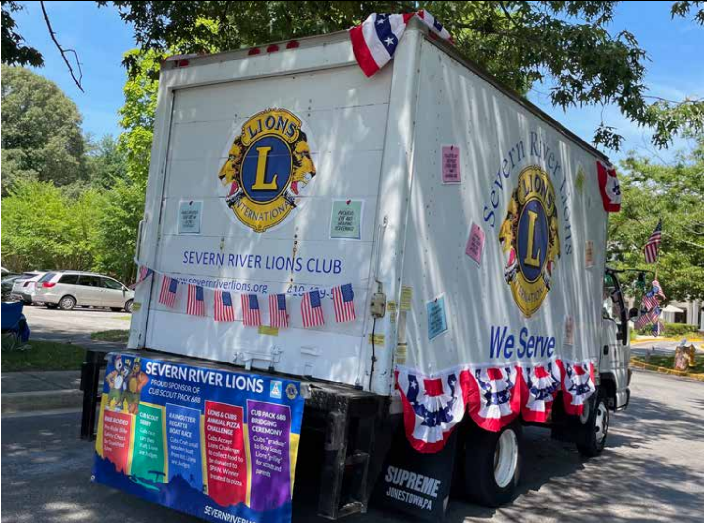
Fully decorated Severn River Lions Club Truck exhibits flag, post-it notes, and banners.