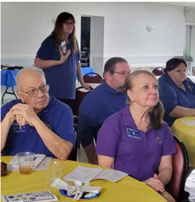
Severn River Lions watch the ceremonies intently.