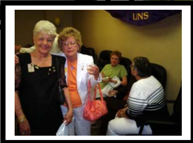
Severn River hosting hospitality room for Lion Dick (now VDGE).