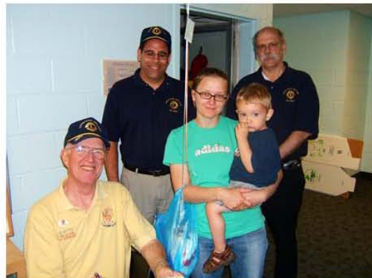
Severn River Lions with one of their "victims"