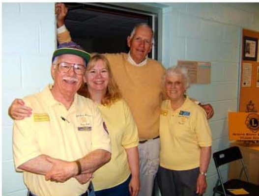
South Anne Arundel Lions

The Children's Fair has been held the first Saturday of May for the past 19 years and is hosted at the Big Vanilla Athletic Club in Arnold, Maryland. This community outreach offers a time for family fun with hands-on educational, resource, and health exhibits that help make a difference in raising children today. The Fair has a special dimension in spotlighting Hometown Heroes, family, business, and civic leaders whose good deeds inspire us to do better, and whose love and actions help children to learn about their culture, to learn what is right and wrong, good and true and what is honorable.