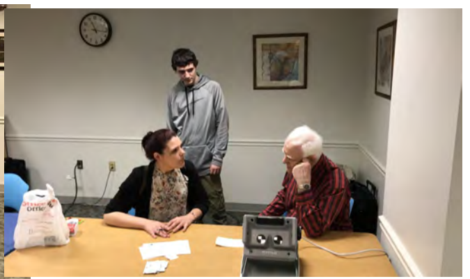
Eye Glass Screening at AA Community College Health Fair