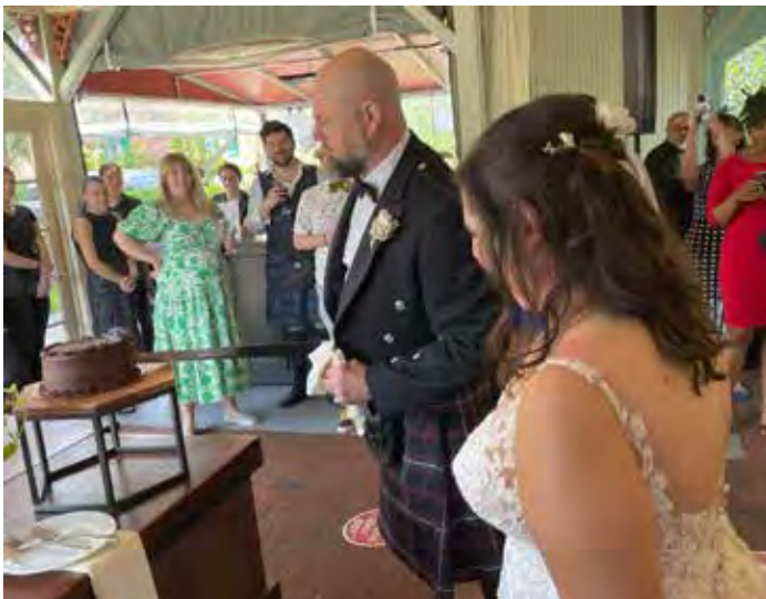
Dancing into the reception and sword-cutting the groom's cake