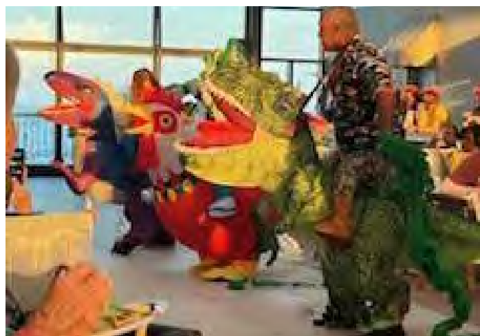
Hospitality Event on Saturday night at the cabanas and Ashore Deck races.