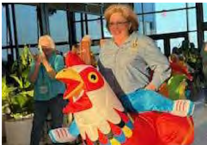
Hospitality Event on Saturday night was complete with food, fun, and fellowship to meet candidates for elected office.