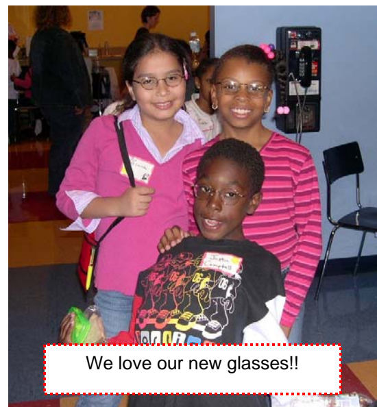
We love our new glasses!!