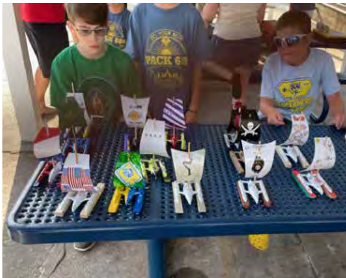
Cub Scouts present entries.