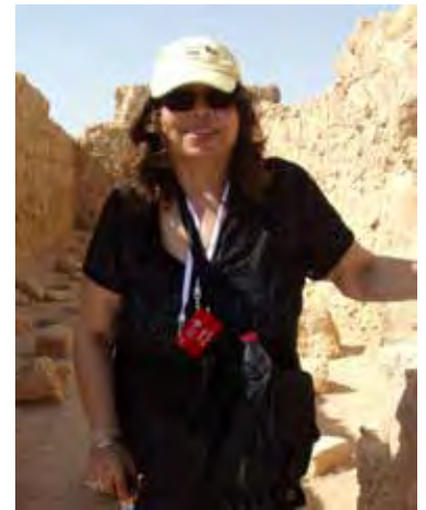
Hiking in the ruins of Israel.

Retirement hasn't slowed me down. I am the District Superintendent for the Baltimore District (serving 28 churches), Baltimore District Caucus Leader for Women in Ministry, and Lions Club District 22A Committee Chair for Diabetes Awareness. I continue to create fine art, oil painting, multi-media art pieces, pen and ink, and charcoal drawing. I also create newsletters for Severn River Lions Club and Women in Ministry monthly.