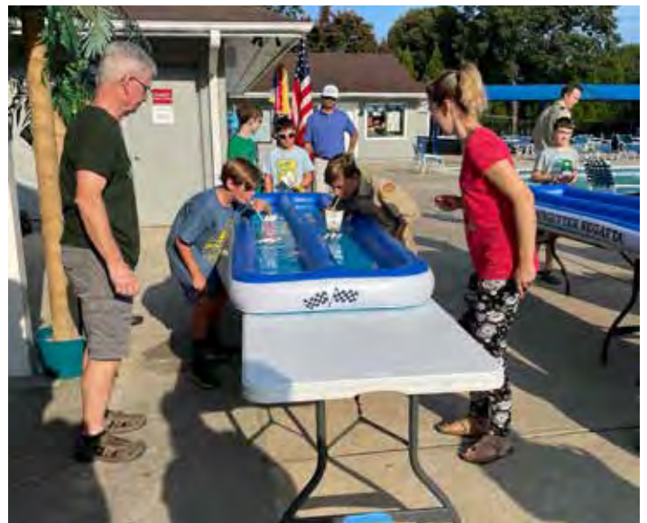
Cub Scouts prepare to race.