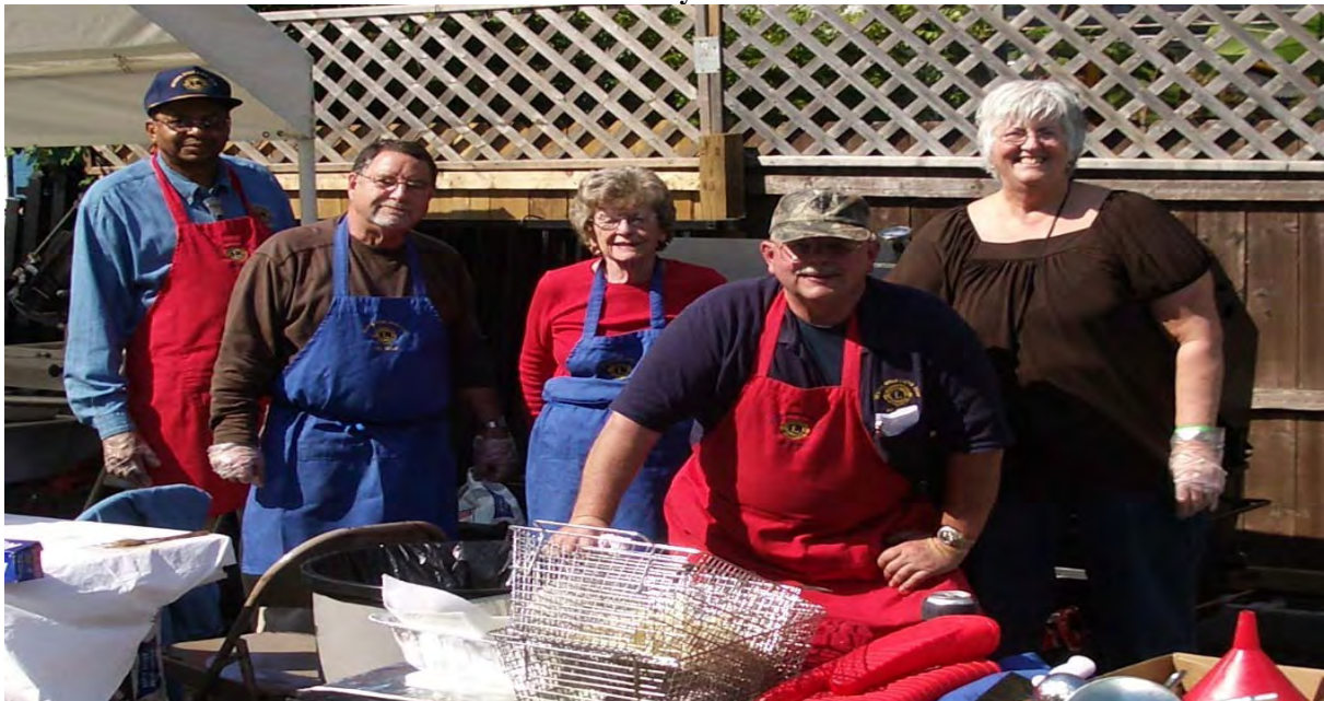
Photos from Gary's Garden Pit Beef service event

When the sign up sheet for the next community health fair is circulated be sure to sign and take part in these worthwhile community service activities.